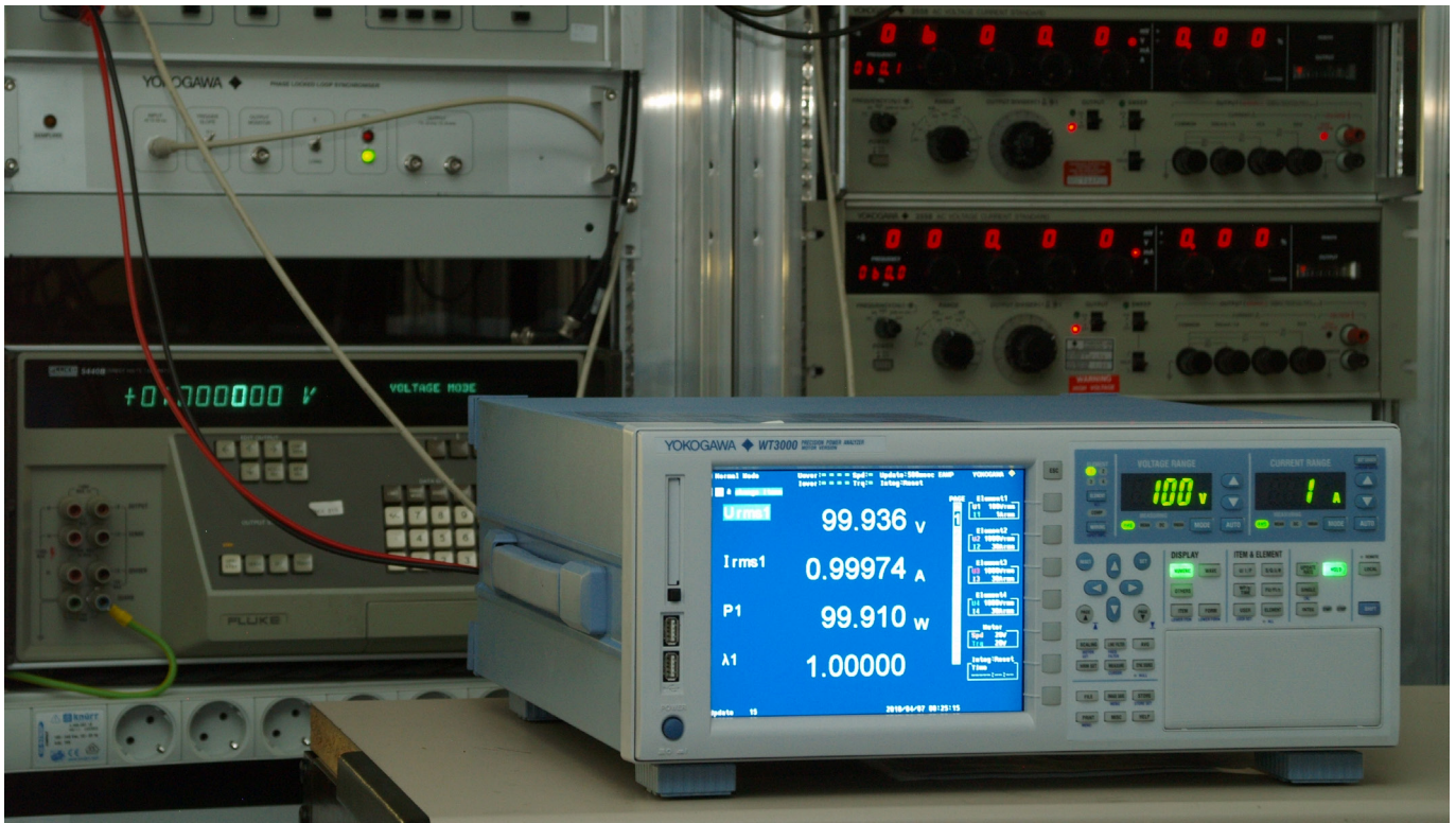
Figure 4 Yokogawa WT3000 Power Analyser