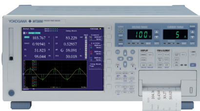
WT3000 Precision Power Analyser

Instruments are adjusted initially at the factory to indicate a value that is as close as possible to the reference value. The uncertainties of the reference standard used in the adjustment process will also dictate the confidence that the indicated value is "correct".