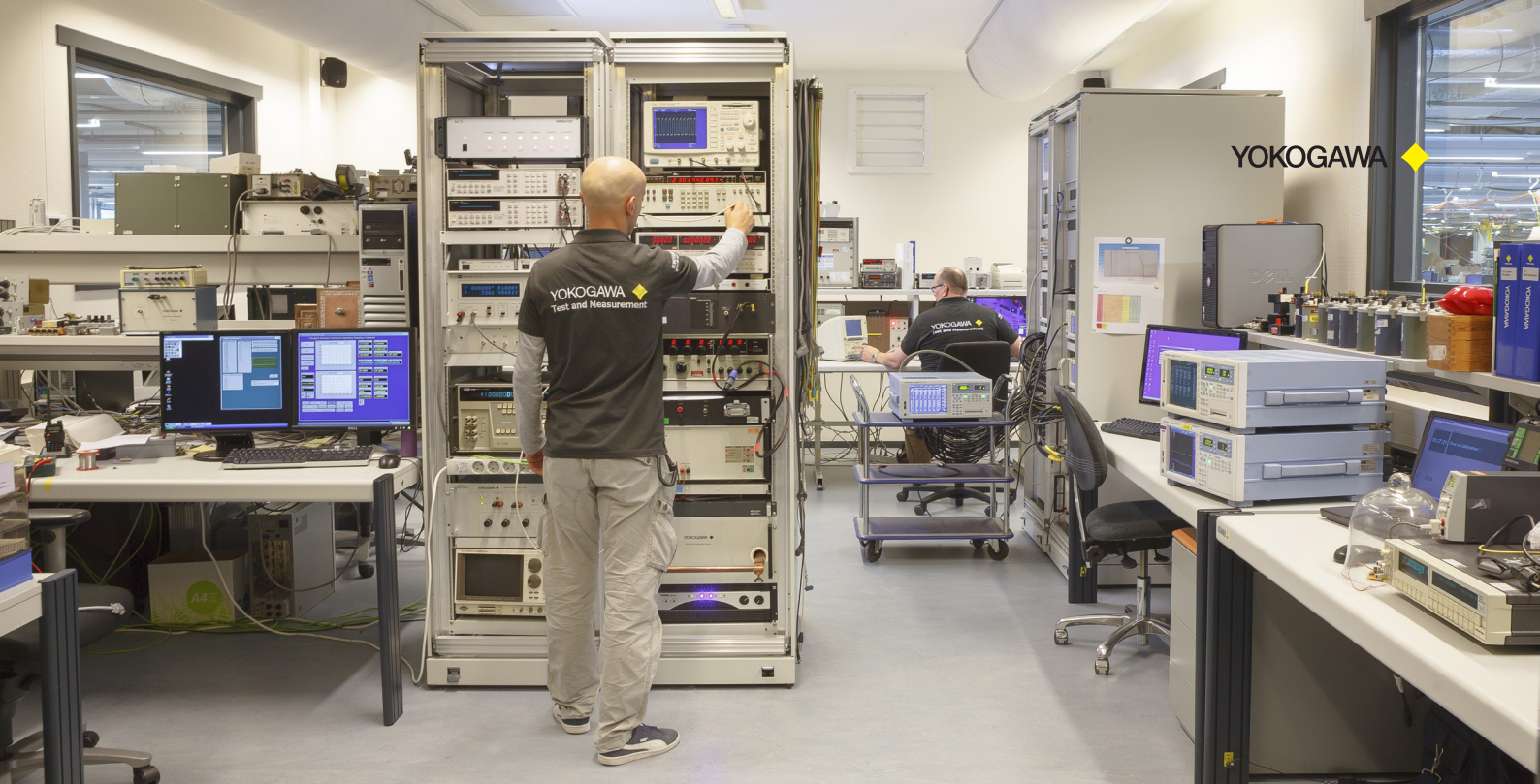
Yokogawa European Calibration Laboratory

Calibration of high-frequency power has lagged behind the development of power meters to address these applications, and few national laboratories can provide traceability up to 100 kHz: the frequency at which instruments have to be calibrated to provide accurate results in these application sectors.