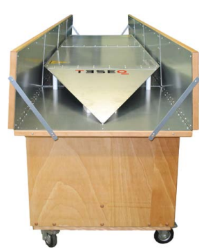
SL 50-s, view 3

Teseq GmbH Landsberger Str. 255 12623 Berlin Germany T+49 30 56 59 88 35 F+49 30 56 59 88 34 desales@teseq.com www.teseq.com