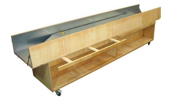
SL 50-s, view 2