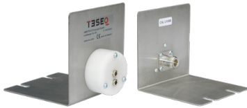
CAL U100B / CAL U100B-50