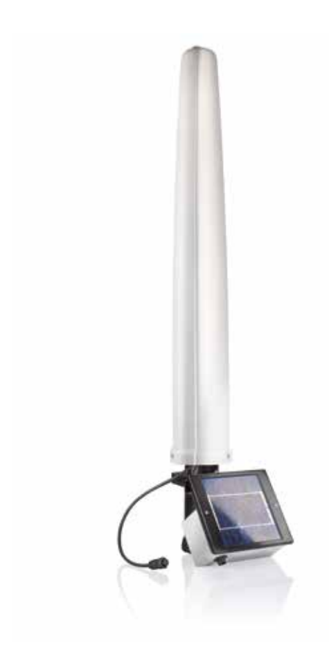
AMB-Series: Minimum outlay, maximum result Its broadband application is the optimum solution for combining tight budgets and technical superiority.

Narda EMF Monitors are equipped with exclusive, state-of-the-art sensors having high sensitivity, accuracy and reliability. Their robust, uncluttered construction is perfect for long-term outdoor installation. You can be certain to find the ideal solution for every area of application with Narda. And, you can depend on its reliability, thanks to our decades of experience coupled with cutting edge technology and backed up by our own certified calibration laboratory.