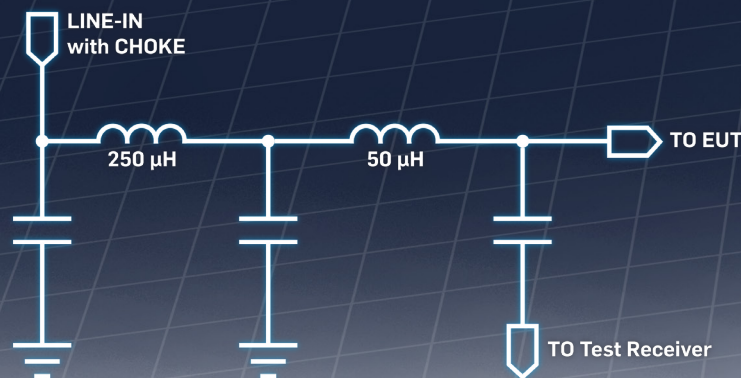
L2-16B equivalent circuit