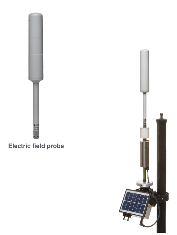
Dual probe configuration (without radome)

This means that emissions from high-voltage cables and transformer stations can be recorded. Further, it is possible to combine up to two probes, e.g. an electric and a magnetic field probe in the so-called "dual probe configuration".