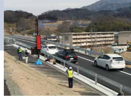
A warning signalization system (e.g. a flashing beacon) along the exit ramp can be activated upon detection in order to warn the unsuspecting wrong-way driver about his or her mistake.

A dynamic incident detection system allows traffic authorities to detect wrong-way drivers very fast, right at the highway's entry point. Fast detection speeds up the process both of warning the wrong-way driver and warning the other traffic about the upcoming vehicle. A number of detection technologies are frequently used, including induction loops and CCTV video cameras, but the technology that is the most efficient and robust on a 24/7 basis is thermal imaging.