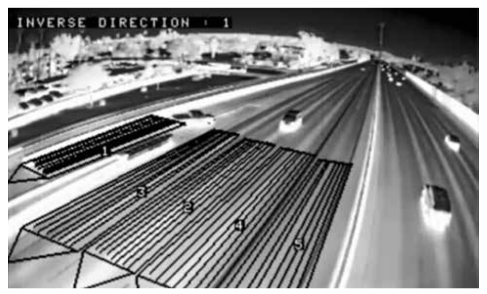
Thermal imaging cameras pick up heat coming off the environment and are therefore the ideal tool to detect vehicles on highways or on highway ramps.

to monitor the wrong-way driver in real time, or use the pre- and post-incident thermal video footage as evidence or for statistical purposes.