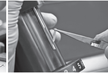
Drop vial into PSI-Probe