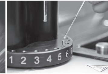
Break TAG into vial