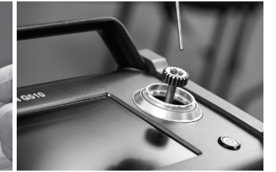
Insert PSI-Probe into injector port