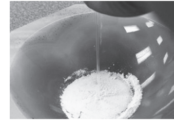
Collect sample with TAG

The GERSTEL-Twister is a unique sampling tool. It is fast, eliminates the need for solvents, and is up to 1000 times more sensitive than SPME. It uses SBSE (stir bar sorptive extraction) to collect organic compounds directly from liquid samples, like drinking or waste water, bodily fluids, or beverages. The Twister adsorbs and concentrates the organic contents onto its sorbent coating. Solid and vapor headspace samples can also be tested via Twister. Simply drop the Twister in a sample vial containing the liquid or solid and seal the vial. Then place the Twister vial on a stir plate. Remove, rinse, dry, and drop the SBSE into the PSI-Probe for thermal extraction and subsequent GC/MS analysis.